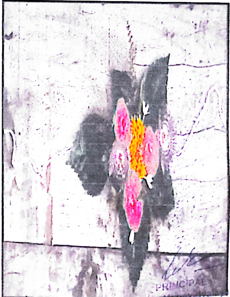
...रा RAKSM bandhan (R...)